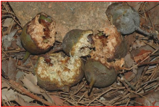
Marri nuts chewed by Forest Red-tailed Black Cockatoo