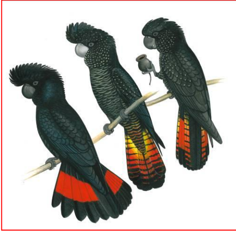
Male (left), Female (centre), Juvenile (right)