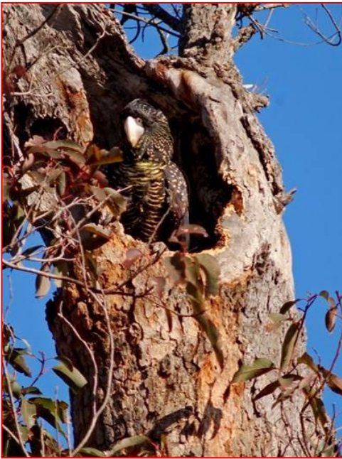
Female Forest Red-tailed Black Cockatoo at nest